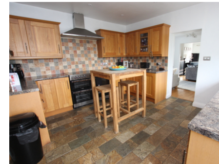
The Old Post Office, 5 Station Road, Lower Stondon, Bedfordshire, SG16 6JP