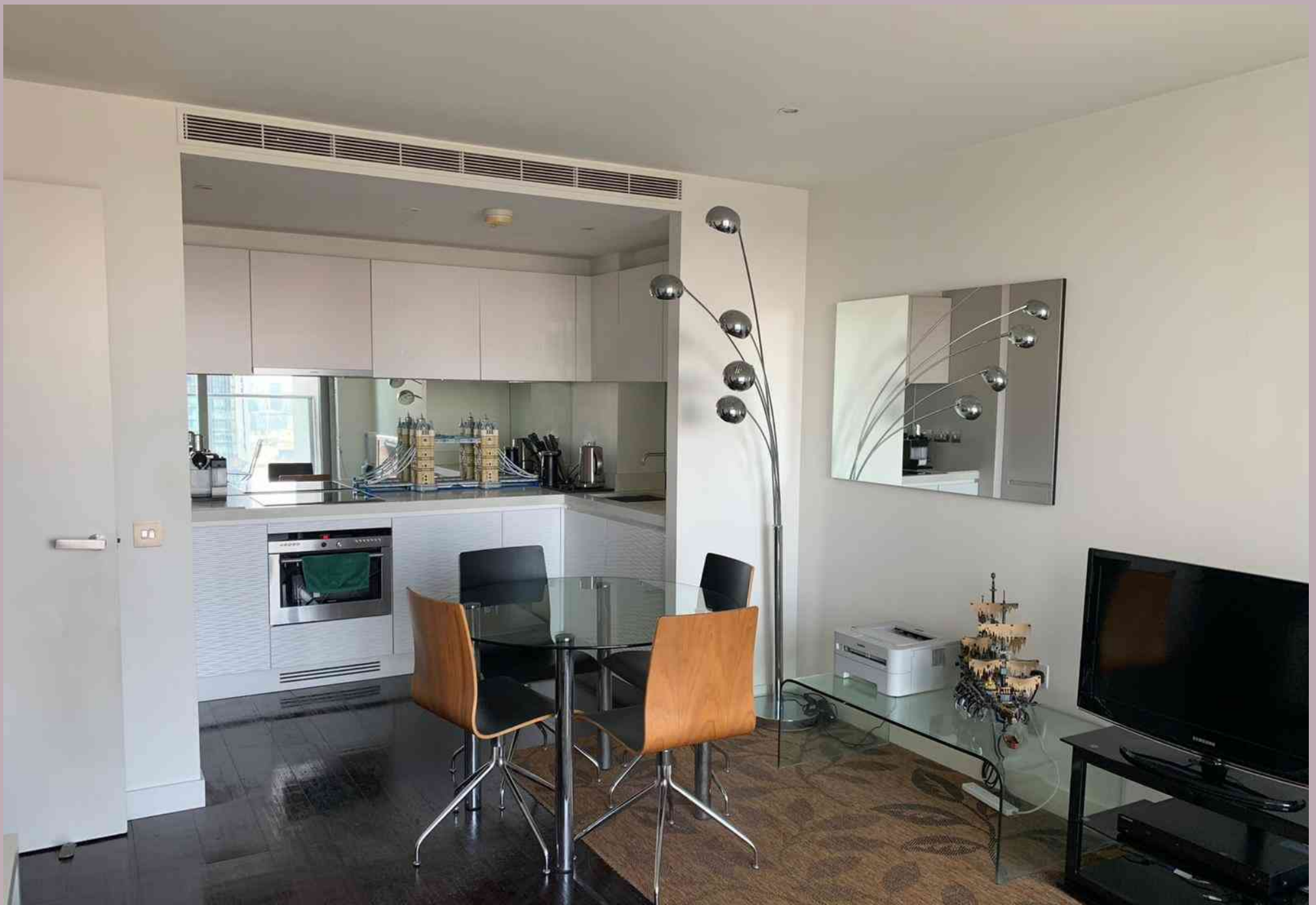
Apt 2903 West Tower, Pan Peninsula 1 Peninsula Square, London £2,500 per calendar month