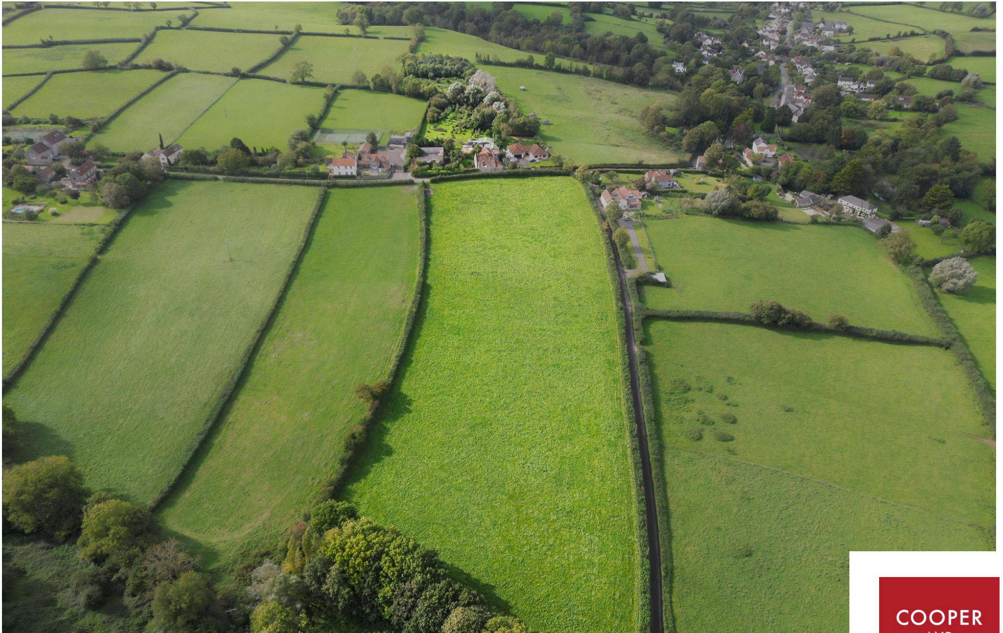
The Shippon BS26 2LN (House, Dutch Barn, 9acres)