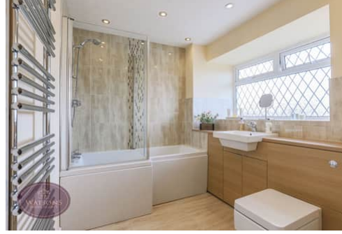
Our Seller says....