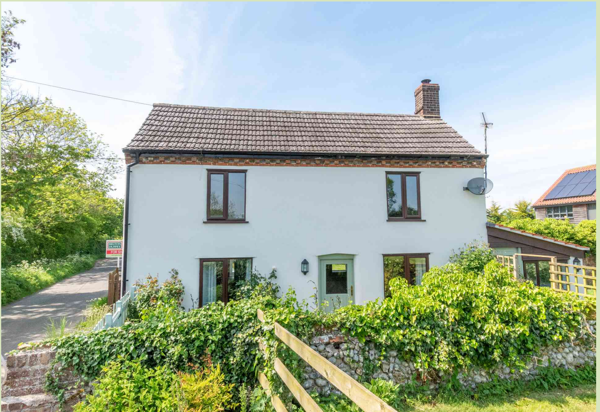
Rose Cottage, Stibbard Guide Price £300,000