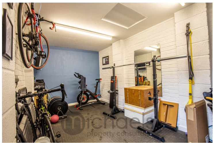
With power and light currently used as a home gym.