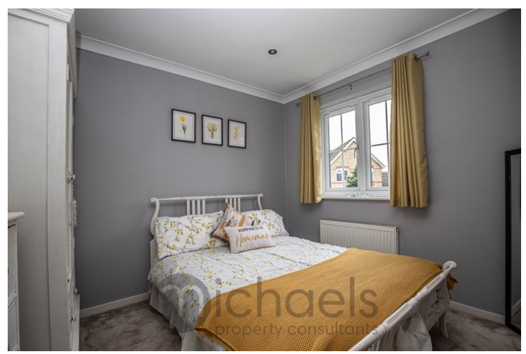
9' 6" x 8' 5" (2.90m x 2.57m)