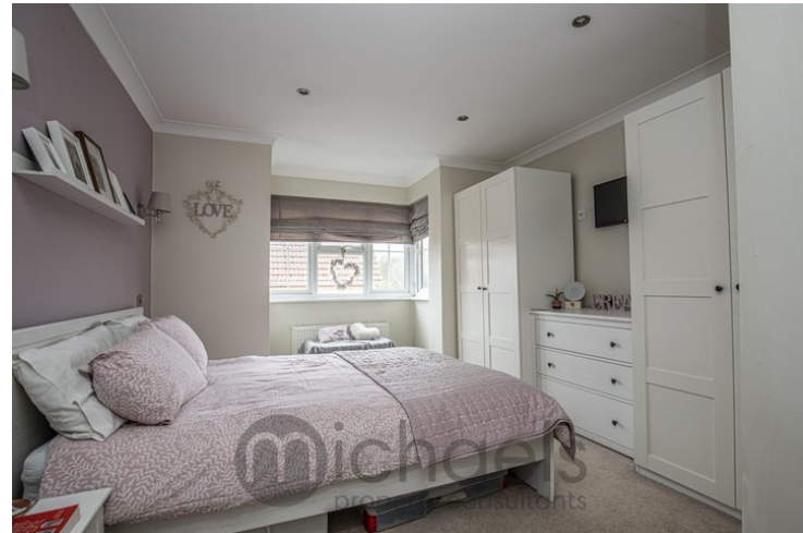
15'9" x 14' 1" (4.80m x 4.29m)