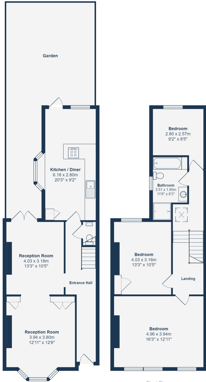
Ground Floor Area: 58.8 m 2 ... 633 ft 2