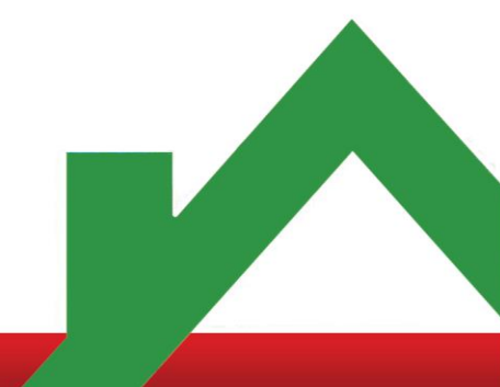
Guide Price £765,000

STRETTON ON DUNSMORE RUGBY WARWICKSHIRE CV23 9NA