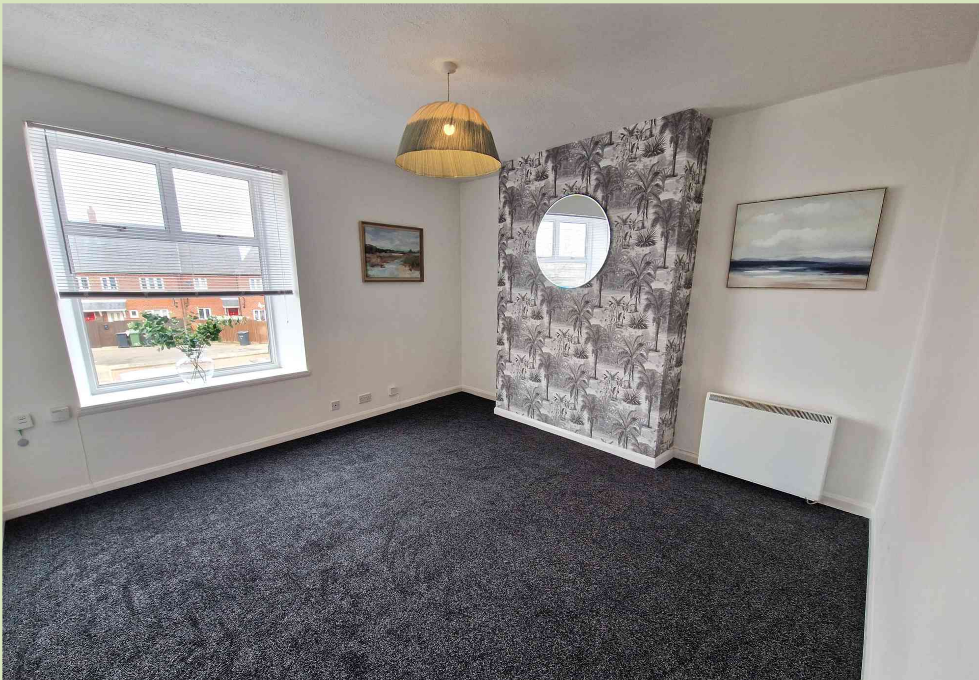
Flat 2 78 Norfolk Street, King's Lynn Offers Over £55,000