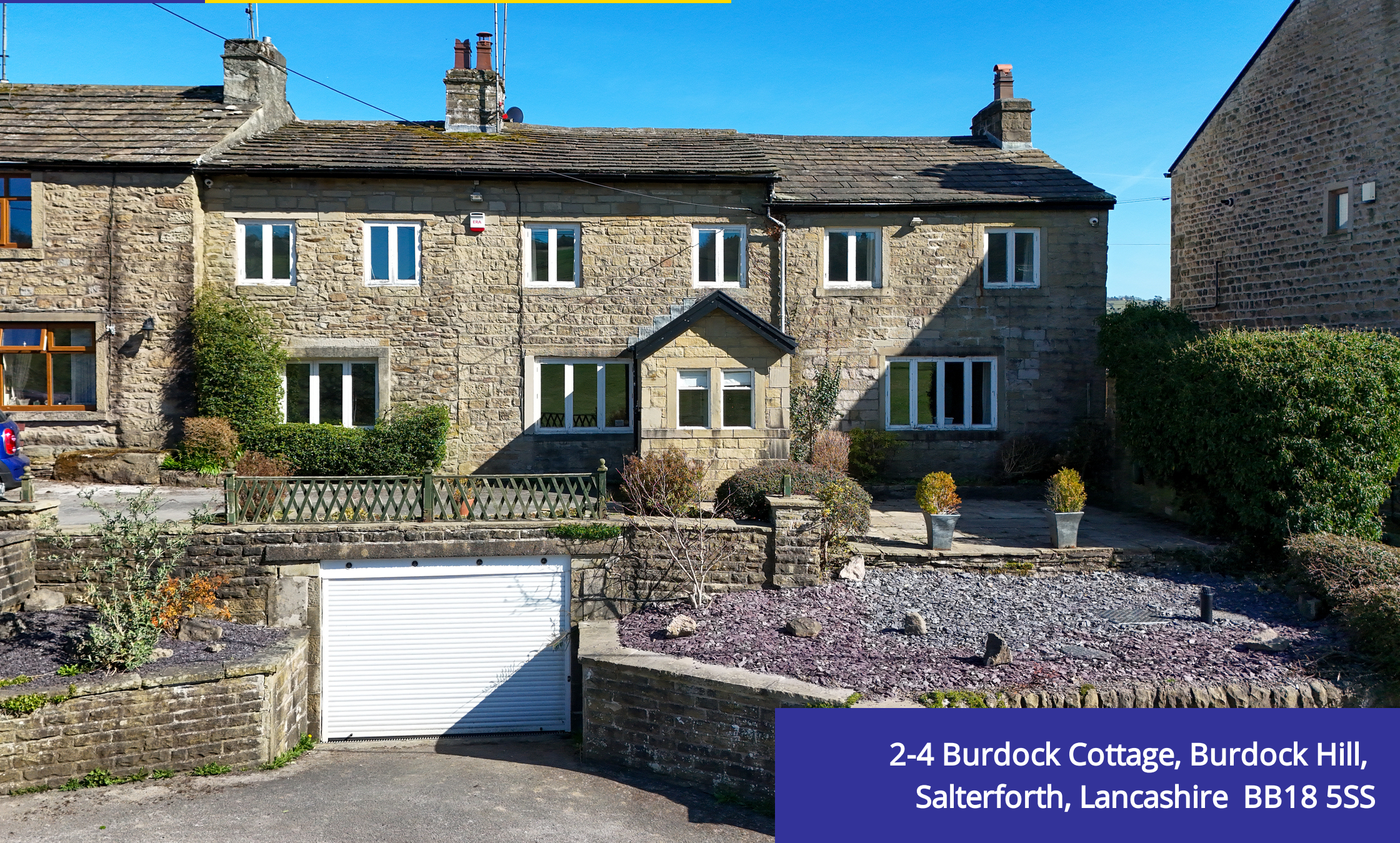
2-4 Burdock Cottage, Burdock Hill, Salterforth, Lancashire BB18 5SS