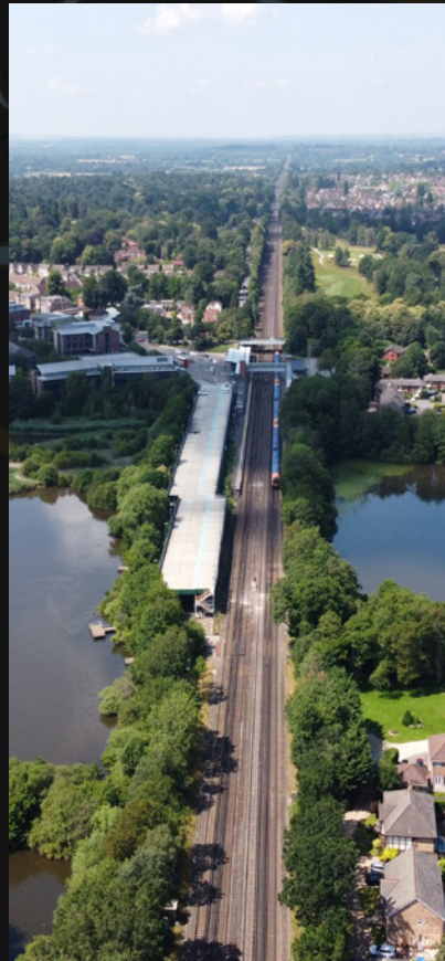
Fleet Rail Line