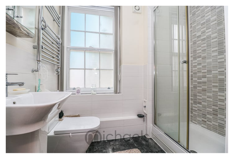
7'4" \times 4'4" (2.2m x 1.3m) En-suite shower room comprising of; W.C wash hand basin, double width shower cubicle, tiled wall finishes, wall mounted heated towel rail, window to front aspect