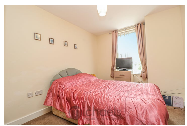
12'6" \times 8'10" (3.8m \times 2.7m) Window to rear aspect, radiator, television point, x2 fitted wardrobes