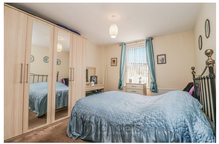
16'3" \times 10'9" (5m x 3.3m) Window to rear aspect, x2 fitted wardrobes, television point, dressing table