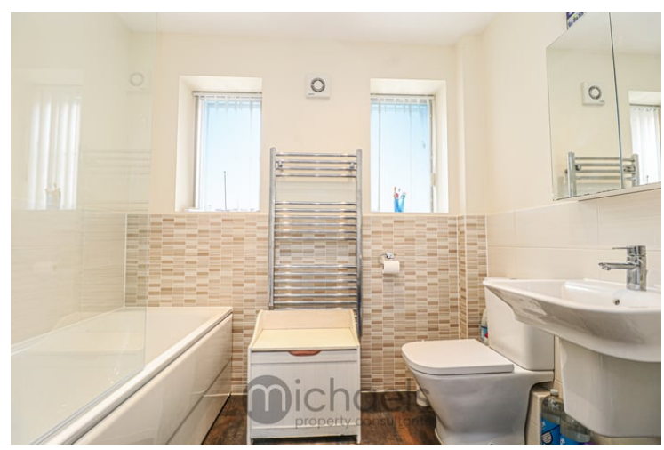
7'8'' \times 5'6'' (2.3m x 1.7m) A tiled bathroom suite comprising of; panel bath with mixer tap and shower attachment over, wall mounted heated towel rail, extractor fan, tiled splash backs, wash hand basin, W.C, x2 windows to rear aspect