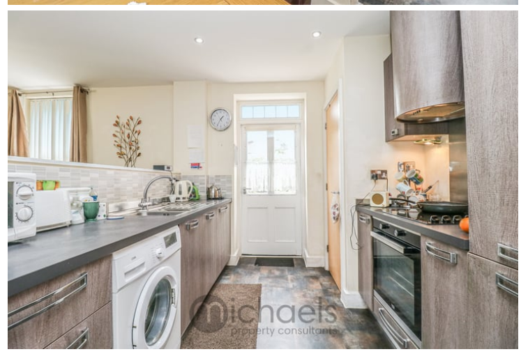
20' x 16'2" (6.1 m x 4.9m) An exceptional open plan living/kitchen/dining area comprising of a tastefully fitted kitchen containing; a range of base and eye level fitted modern units with worksurfaces over, inset hob with extractor fan over, tiled splashback, inset stainless steel sink, drainer and mixer tap over, integrated appliances including; fridge/freezer, dishwasher, electric fan assisted oven and grill, space under counter for washing machine, dual aspect windows, x2 radiators, variety of communication input/output points, door to rear aspect (providing access to a terrace area and communal gardens), access to: