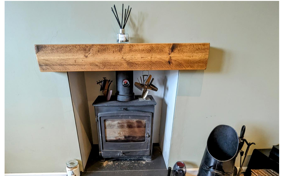
Cheriton Drive, Ilkeston, Derbyshire DE7 9HP £385,000 - Freehold