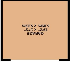
GARAGE 329 sq.ft. (30.6 sq.m.) approx.

TOTAL FLOOR AREA : 3574 sq.ft. (332.0 sq.m.) approx. Whilst every attempt has been made to ensure the accuracy of the floorplan contained here, measurements of doors, windows, rooms and any other items are approximate and no responsibility is taken for any error, omission or mis-statement. This plan is for illustrative purposes only and should be used as such by any prospective purchaser. The services, systems and appliances shown have not been tested and no guarantee as to their operability or efficiency can be given. Made with Metropix ©2023