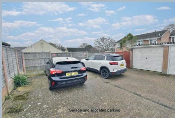
Garage and allocated parking