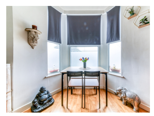
Lennard Road, Croydon, Surrey, CR0