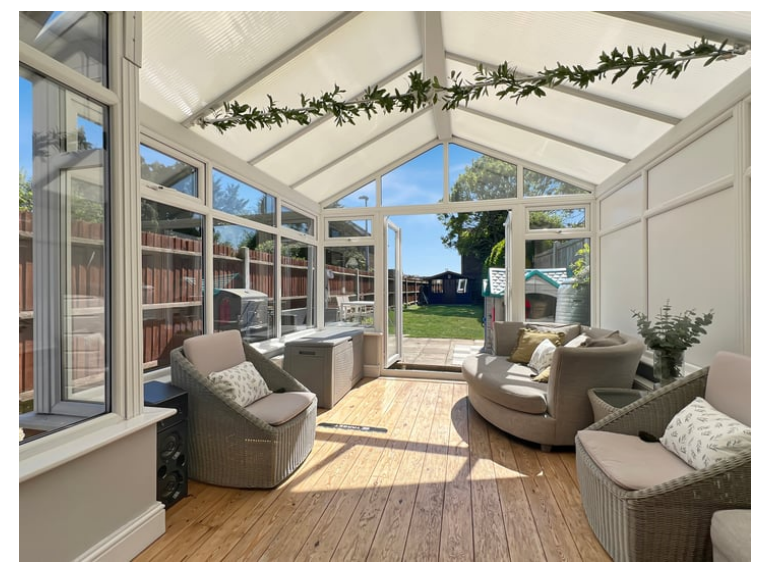
18' 8" x 13' 5" (5.69m x 4.09m)