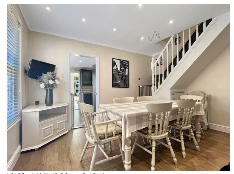
12'9" x 11'5" (3.89m x 3.48m)