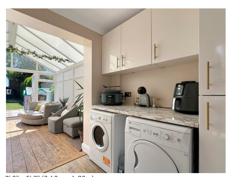
7' 2" x 5' 7" (2.18m x 1.70m)