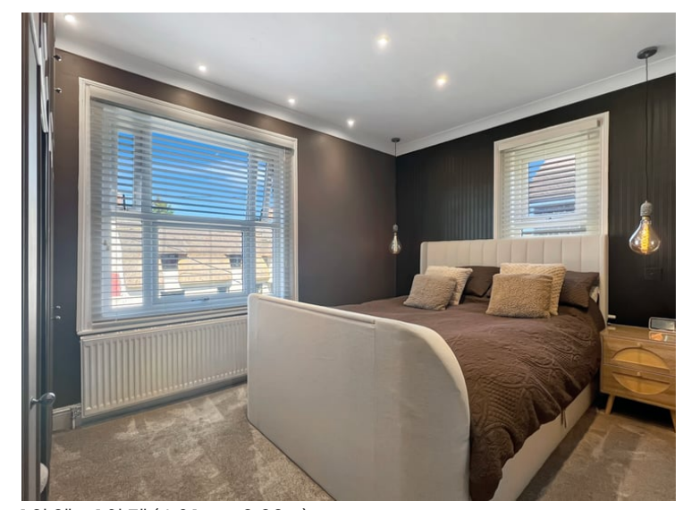
13' 2" x 10' 7" (4.01m x 3.23m)