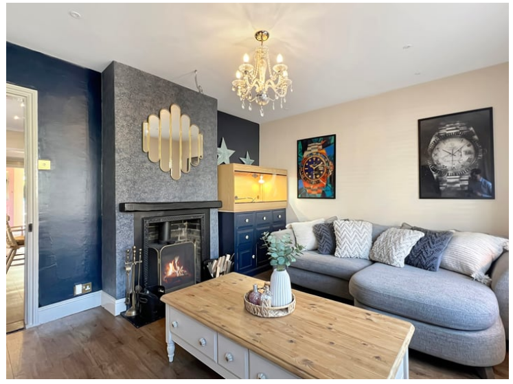
13' 1" x 11' 1" (3.99m x 3.38m)