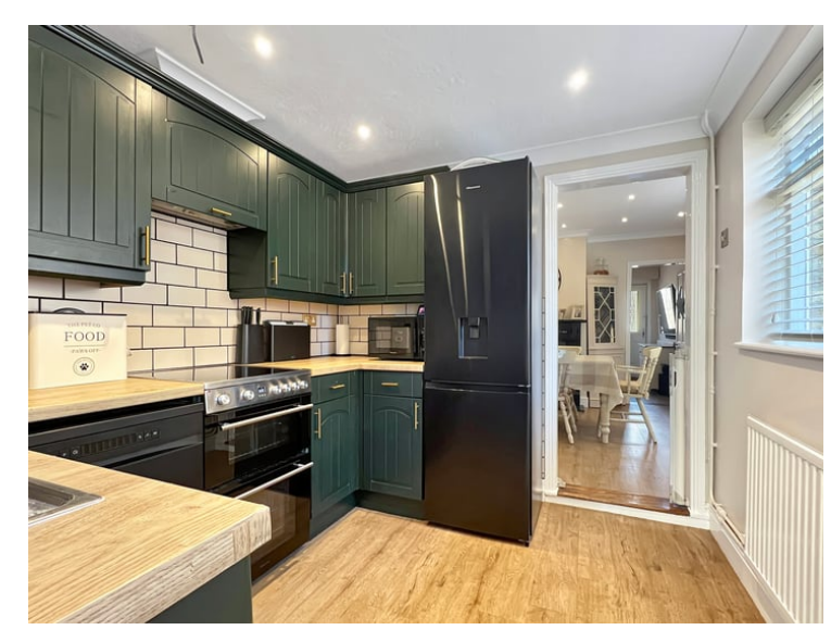
9' 4" x 8' 4" (2.84m x 2.54m)