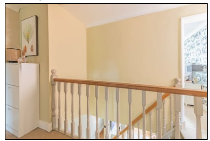
13' 10" x 5' 5" (4.22m x 1.65m) plus11' 8" x 2' 8" (3.56m x 0.81m) Doors to bedrooms, access to part boarded and insulated loft, airing cupboard housing insulated tank and Worcester Bosch gas fire boiler.