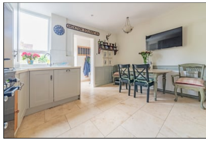
11' 5" x 12' 6" (3.48m x 3.81m) Attractive and comprehensively fitted kitchen with wall and base units, composite worktops, integrated Indesit half and half fridge freezer, Hoover washer dryer, Rangemaster gas cooker with extractor hood, Hotpoint dishwasher, ceramic single drainer sink unit, integrated bin/recycling cupboard, corner carousel unit, integrated trays and chopping boards, underfloor heating, door to rear lobby.