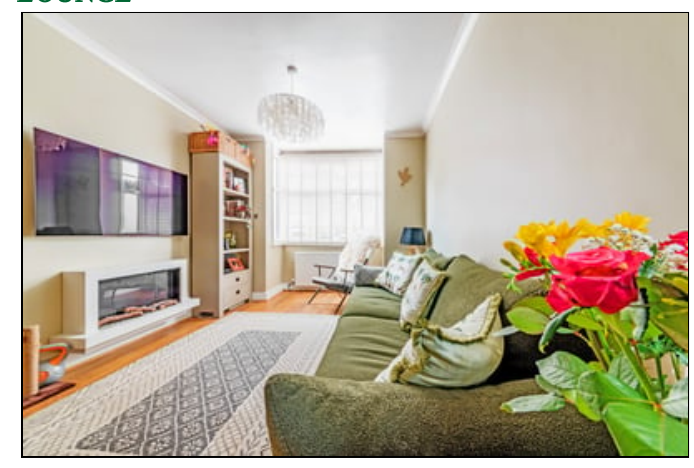
15' 6" x 12' 6" (4.72m x 3.81m) Double glazed square bay window to front, radiator, laminate wood floor, electric log effect feature fireplace.