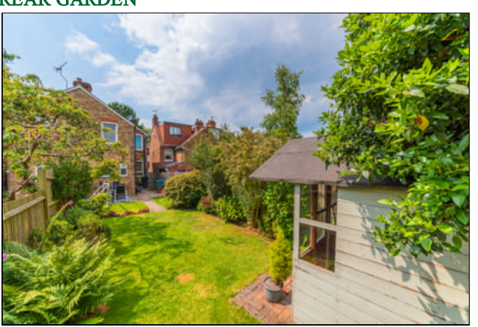
Approximately 50 ft long with patio area for table and chairs to lawn with well stocked flower beds, summer house 6'8 x 4'8, outside light.