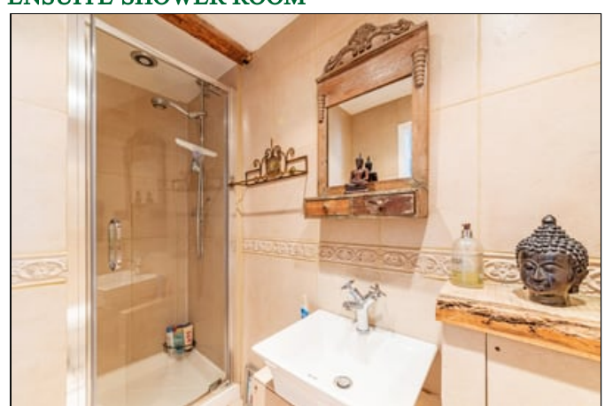
8' 7" x 3' 9" (2.62m x 1.14m) Enclosed shower cubicle with Aqualisa shower, wash hand basin low level W.C., chrome heated towel rail, tiled walls