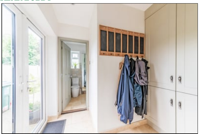
Fitted coats cupboard and broom cupboard , door to bathroom, double glazed French doors to garden.