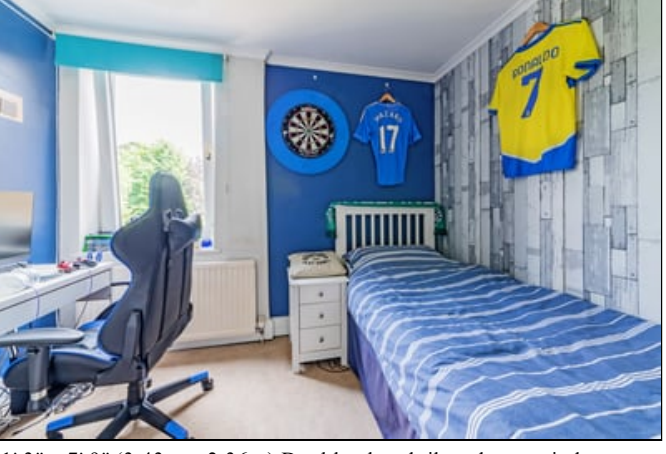
11'\,3"\,x\,7'\,9"\,(3.43m\,x\,2.36m) Double glazed tilt and turn window to rear, radiator.