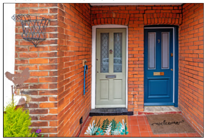
Recessed entrance porch with tiled floor, light, front door.