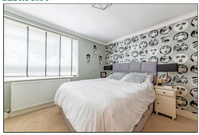
10' 5" x 12' 6" (3.17m x 3.81m) Double glazed window to front, radiator, recess with wardrobes, doorway to ensuite.