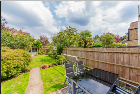
9 HEATHFIELD ROAD, SEVENOAKS, KENT TN13 3DA

Lovely Edwardian style 3 bedroomed semi detached home which has been stylishly updated and improved to provide a well balanced family home in the centre of Riverhead. Tucked within a private road and in walking distance of shops, schools and station. There is off street parking to front and lovely cottage garden to rear with summer house.