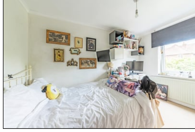
8' 8" x 9' 3" (2.64m x 2.82m) Double glazed tilt and turn window to rear, radiator.