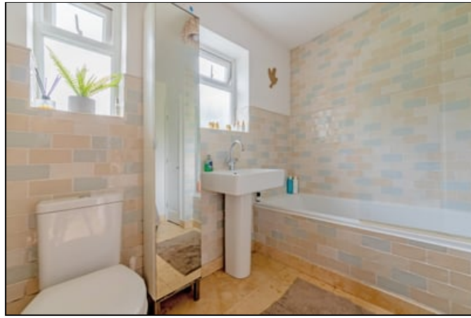
8' 3" x 7' 8" (2.51m x 2.34m) Modern white suite comprising panelled bath with overhead Aqualisa shower, pedestal wash hand basin, low level W.C., fitted full length mirror door cupboard, linen cupboard, part tiled walls, tiled floor, under floor heating, opaque double glazed windows to rear, chrome heated towel rail.