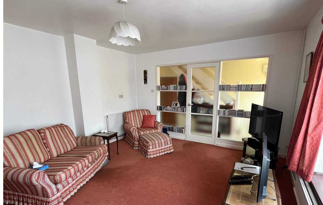
65a Harvest Road, Feltham, Greater London TW13 7JH £499,950 - Freehold