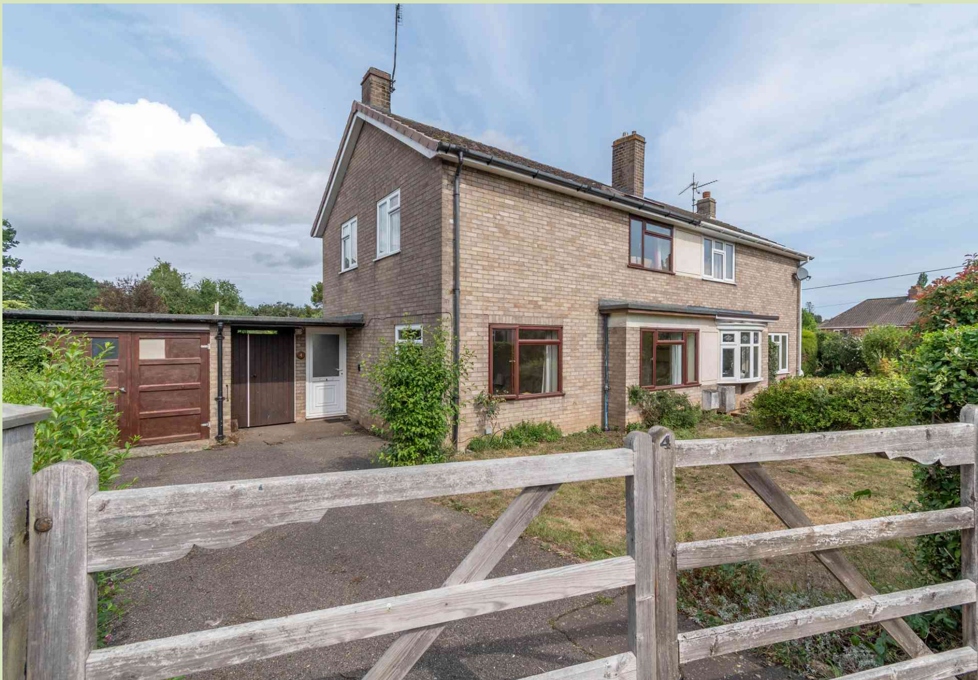
4 Clarendon Road, Fakenham Guide Price £250,000