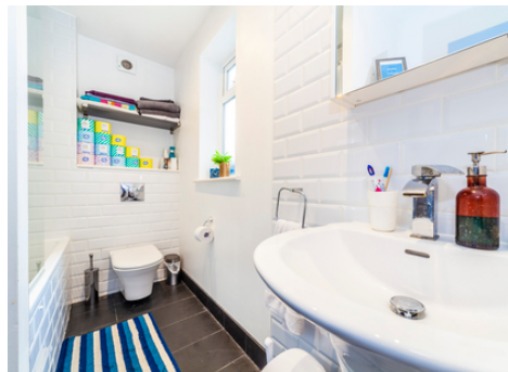
Crowther Road, London, SE25