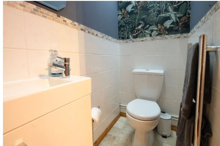
Low level WC, wash hand basin and shower cubicle.