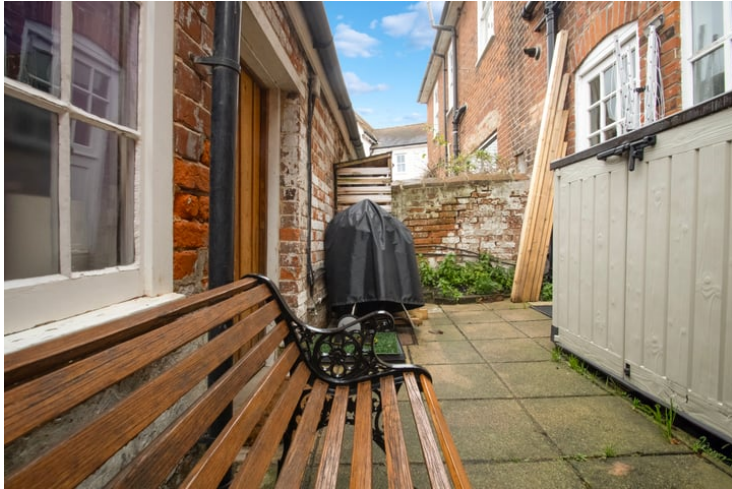
Courtyard laid to patio, retained by brickwall, access to the courtyard.