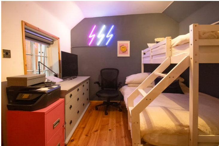
10' 6" x 9' 5" (3.20m x 2.87m) Entrance from courtyard. Window, wooden floor separate boiler to the main house, radiator.