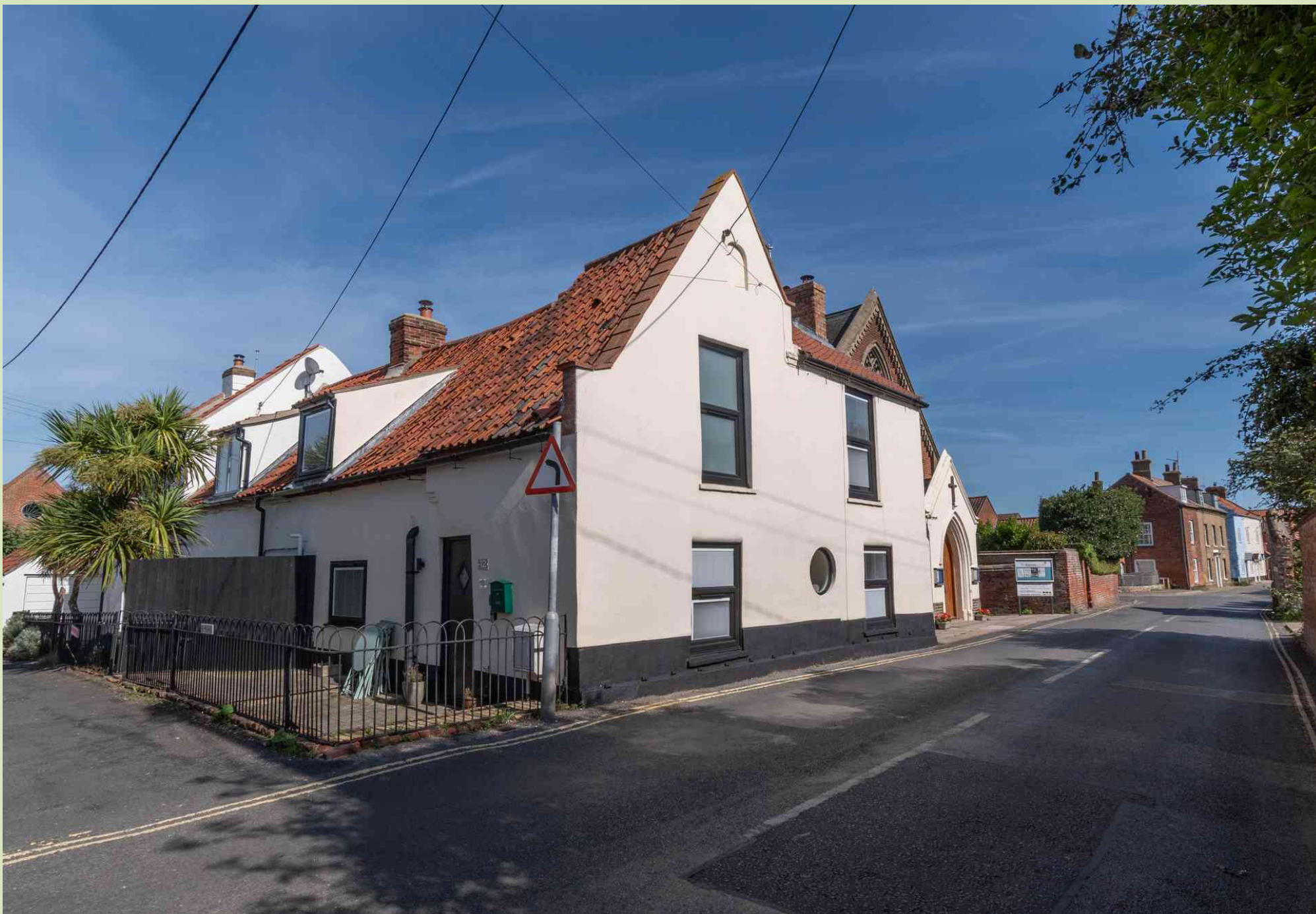
Lovedays, Wells-next-the-Sea Guide Price £500,000