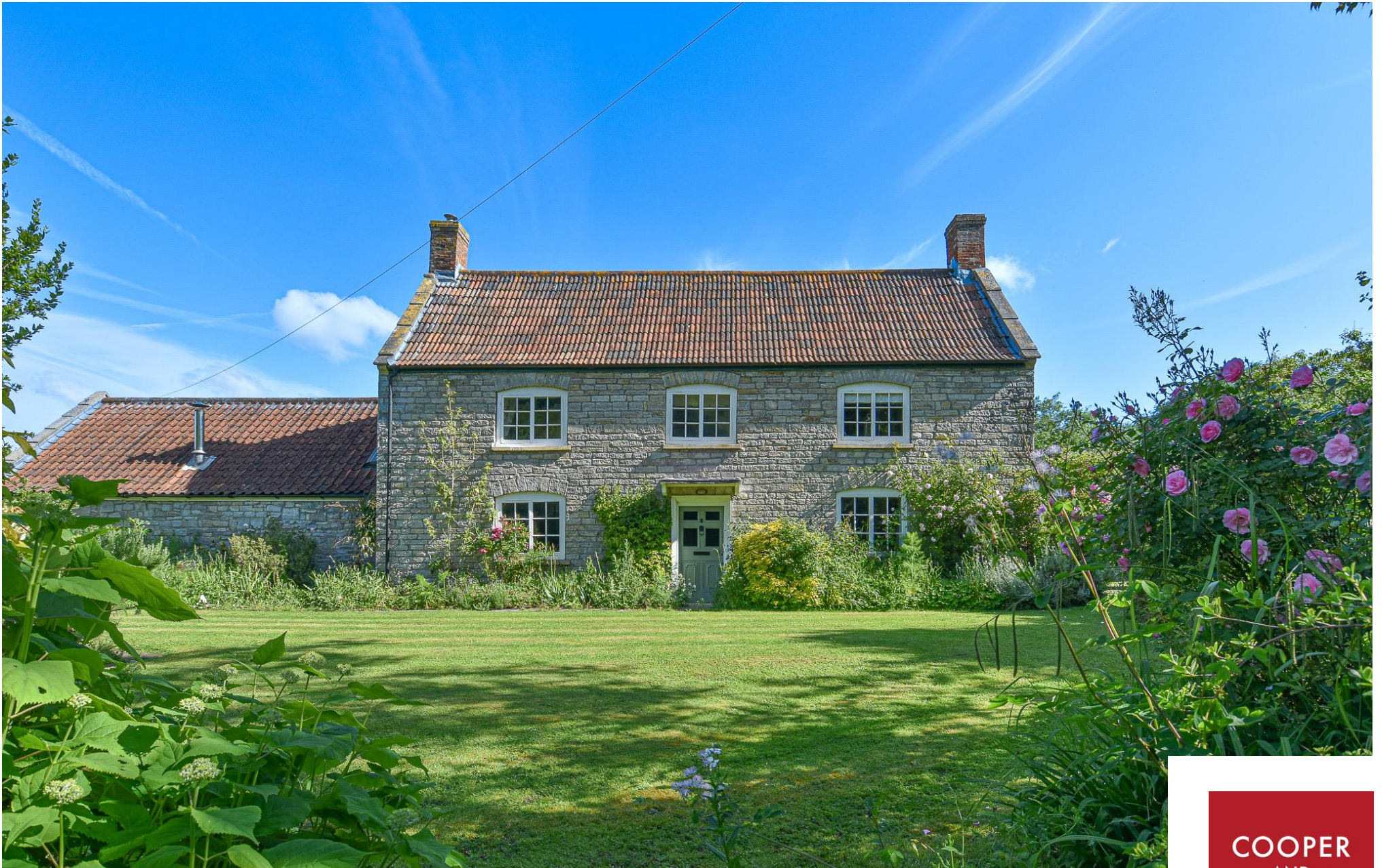
Alvion House, Theale, Wedmore BS28 4SL