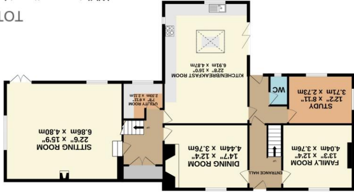
GROUND FLOOR 1478 sq.ft. (137.3 sq.m.) approx.