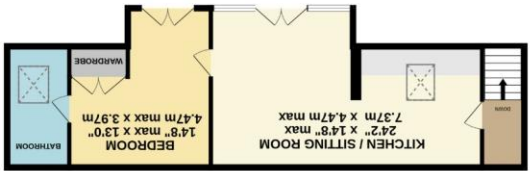
ANNEXE 599 sq.ft. (55.6 sq.m.) approx.