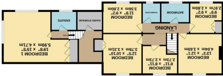
1ST FLOOR 1207 sq.ft. (112.1 sq.m.) approx.