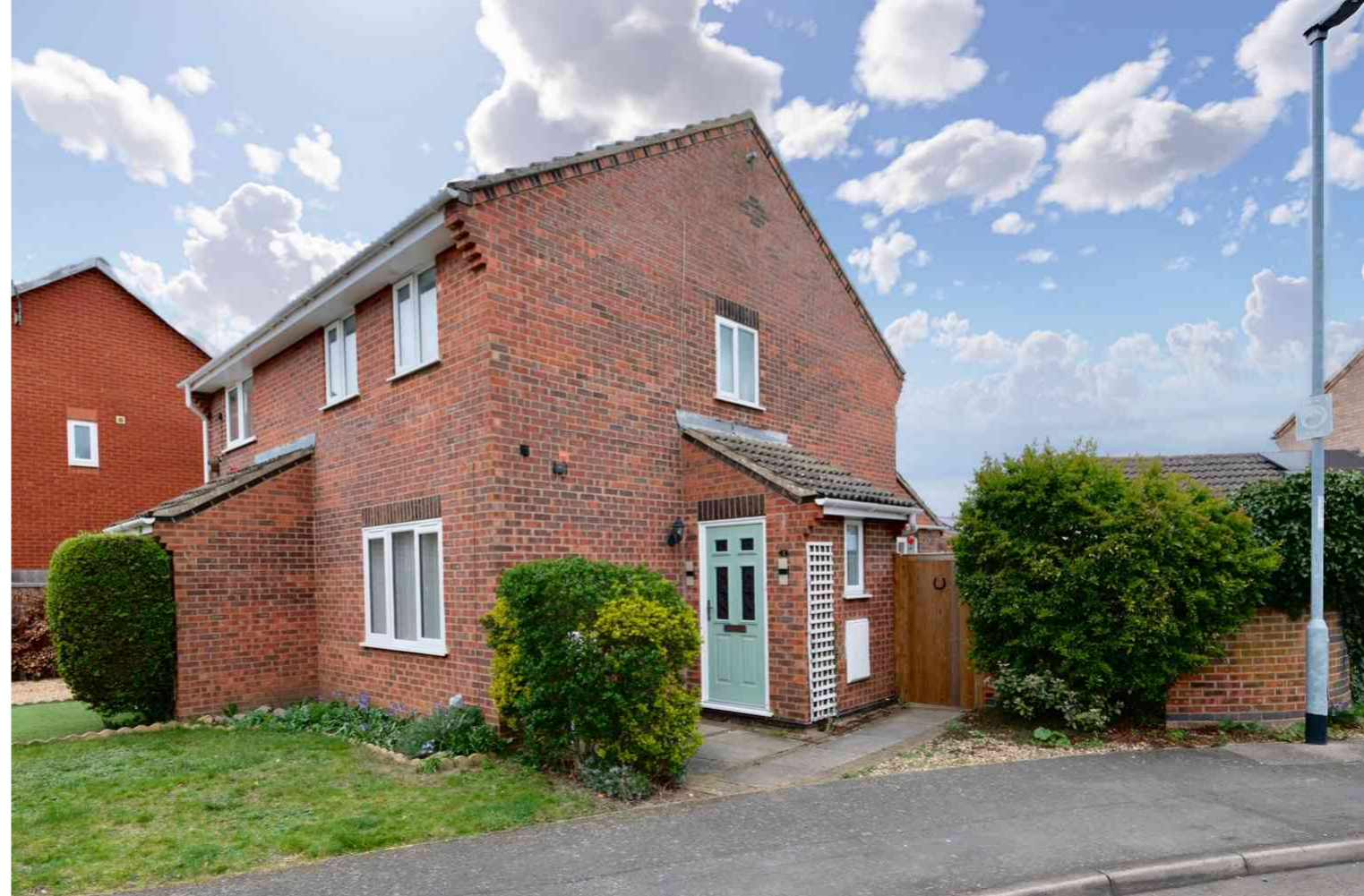
Pages Way, Brampton PE28 4UR