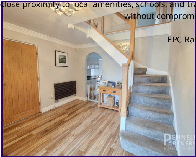
EPC Rating: D (64)

Location: Willowbrook Drive, Coates, offers the perfect blend of tranquillity and accessibility. Situated within close proximity to local amenities, schools, and transport links, this property provides an idyllic retreat without compromising on convenience.