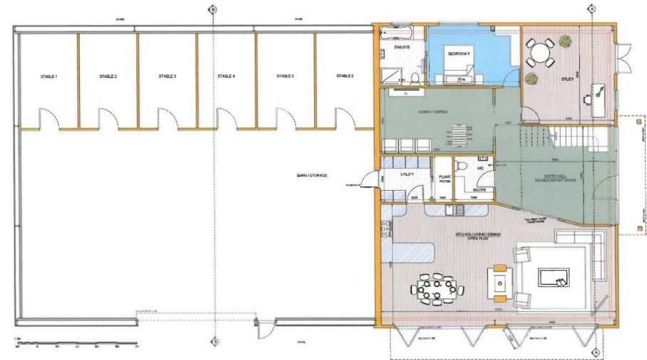
Proposed – Ground Floor