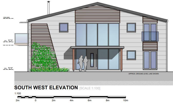
SOUTH WEST ELEVATION [SCALE 1:100]

1. © COPYRIGHT All designs and information conveyed are the intellectual property of HILL READING ARCHITECTS. The unauthorised copying, usage or distribution of this drawing or the contents of, in part or in whole is forbidden without express permission. 2. All dimensions to be checked on site and any discrepancy immediately reported to the architect.