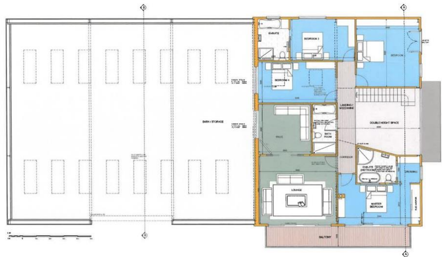
Proposed – First Floor