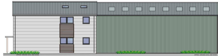
SOUTH EAST ELEVATION [SCALE 1:100]