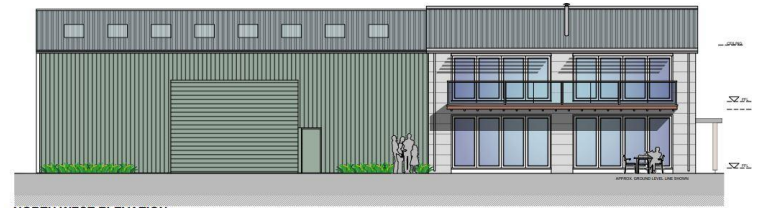
NORTH WEST ELEVATION [SCALE 1:100]

1. © COPYRIGHT All designs and information conveyed are the intellectual property of HILL READING ARCHITECTS. The unauthorised copying, usage or distribution of this drawing or the contents of, in part or in whole is forbidden without express permission. 2. All dimensions to be checked on site and any discrepancy immediately reported to the architect.