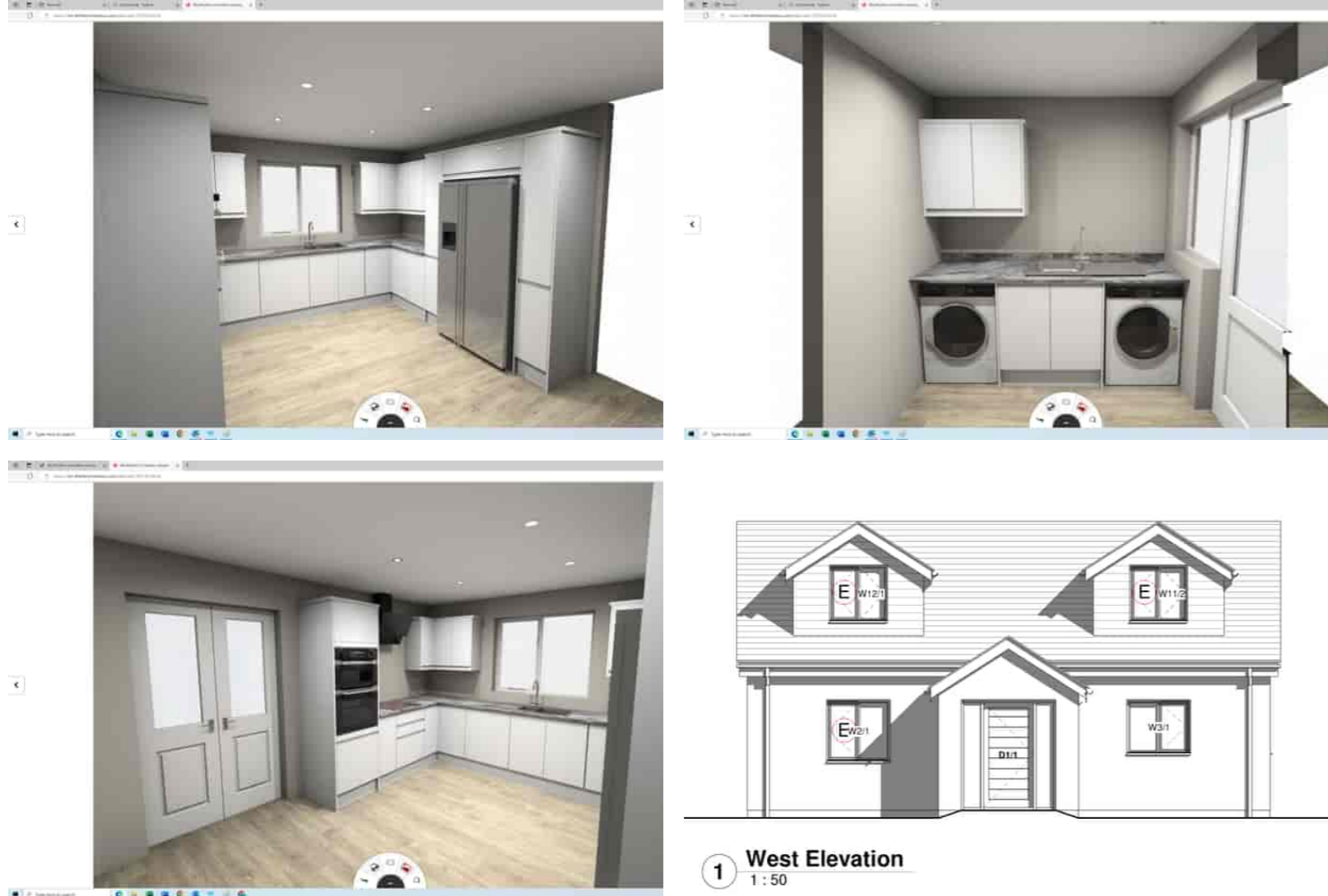
1 West Elevation 1 : 50