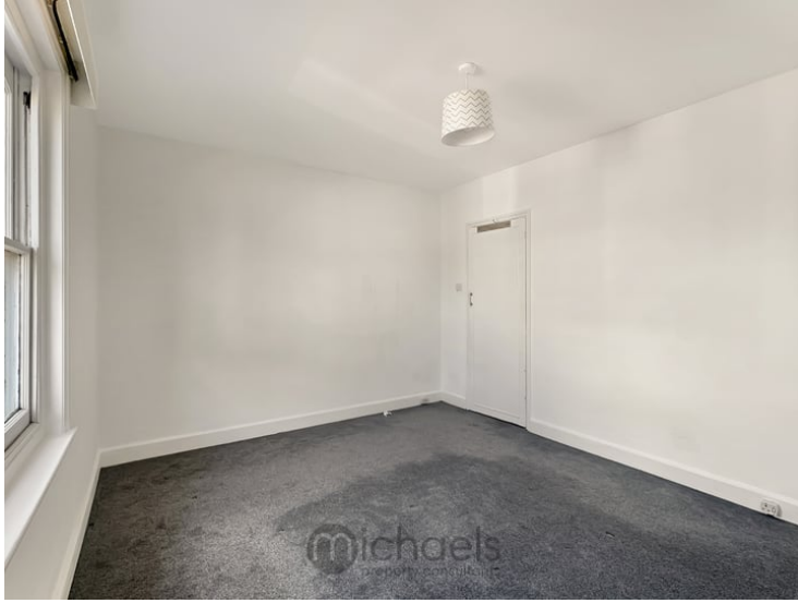
3.85m x 3.17m (12' 8" x 10' 5") Window to front aspect, radiator