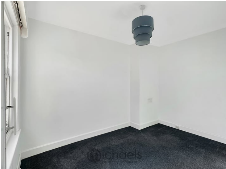
3.35m x 2.44m (11' 0" x 8' 0") Window to rear aspect, radiator