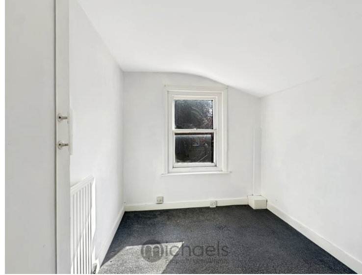
2.65m x 2.15m (8' 8" x 7' 1") Window to rear aspect, radiator