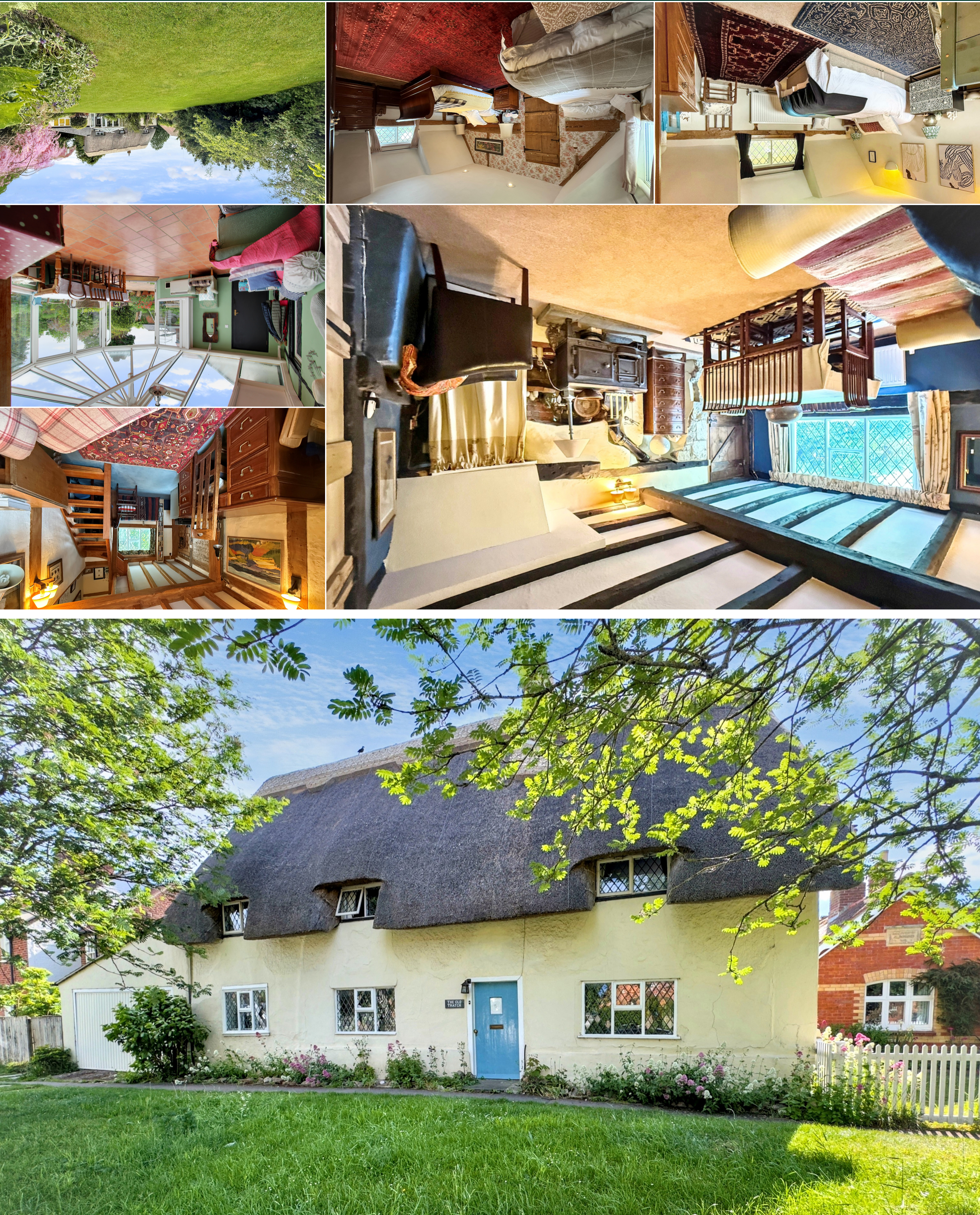
The Old Thatch, High Street, Childrey, Wantage, Oxfordshire OX12 9UA Oxfordshire, £800,000