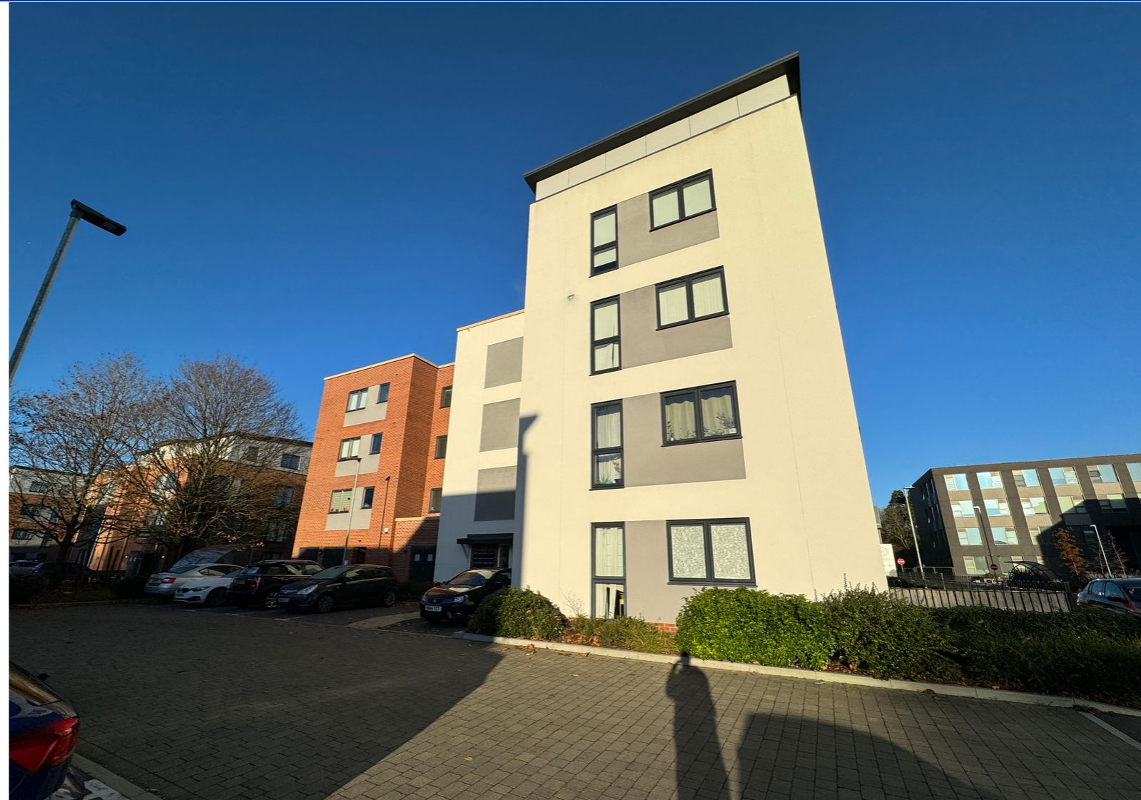
Ruhemann Street, Reading, Berkshire. RG30 3FH.