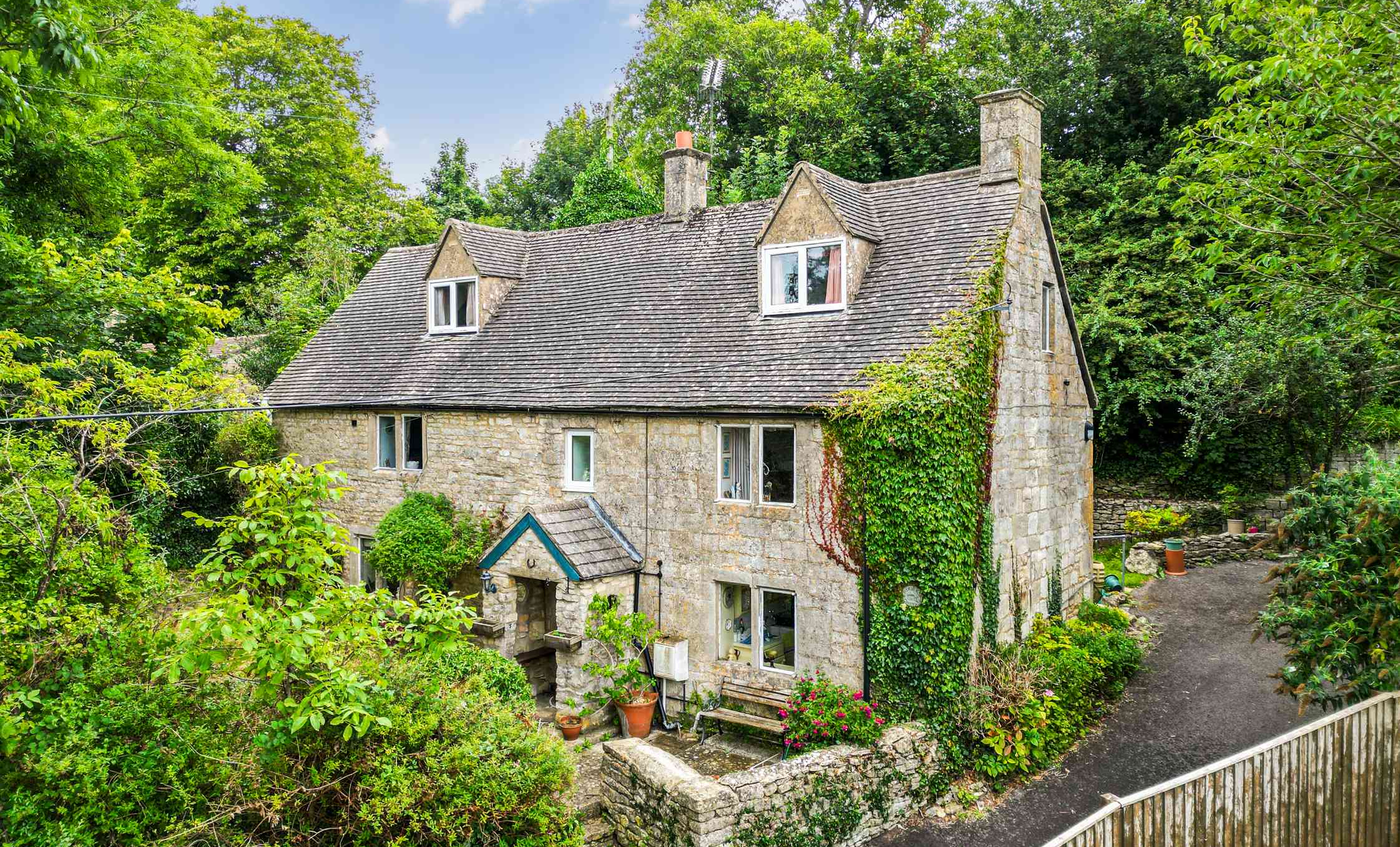
Weavers Cottage, Bussage, Stroud, Gloucestershire, GL6 8BB Guide Price £575,000