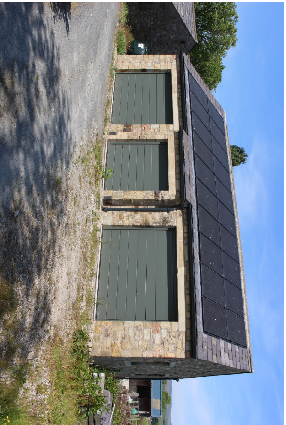
Former Garage with PP for new build house extension