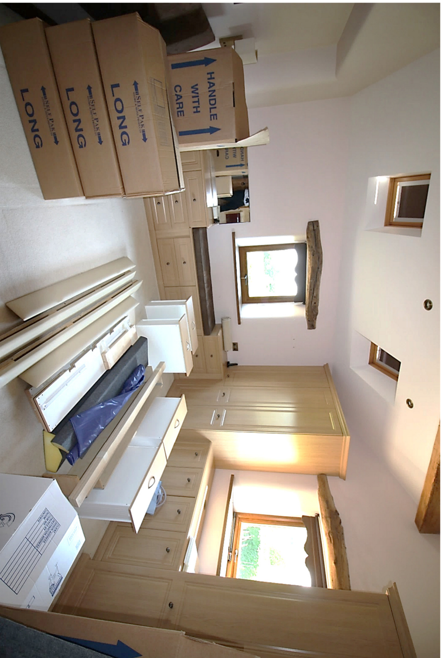
Bedroom 1 Ensuite