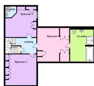
Total area approx. 7071 sq. metres (2523 sq. ft)