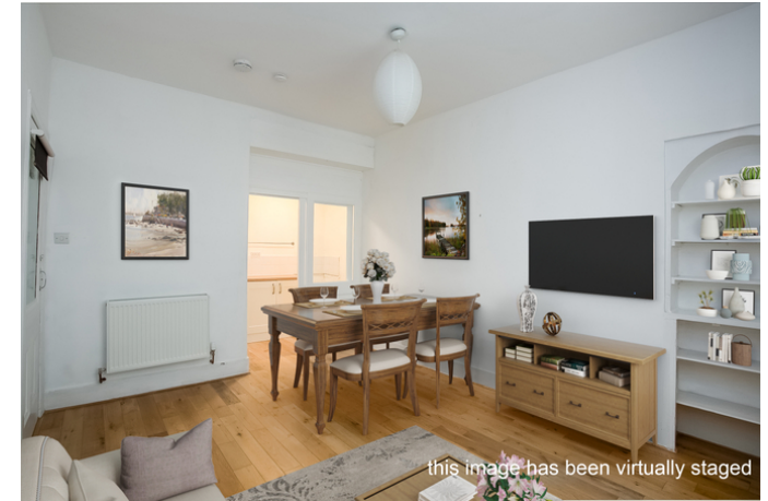
this image has been virtually staged