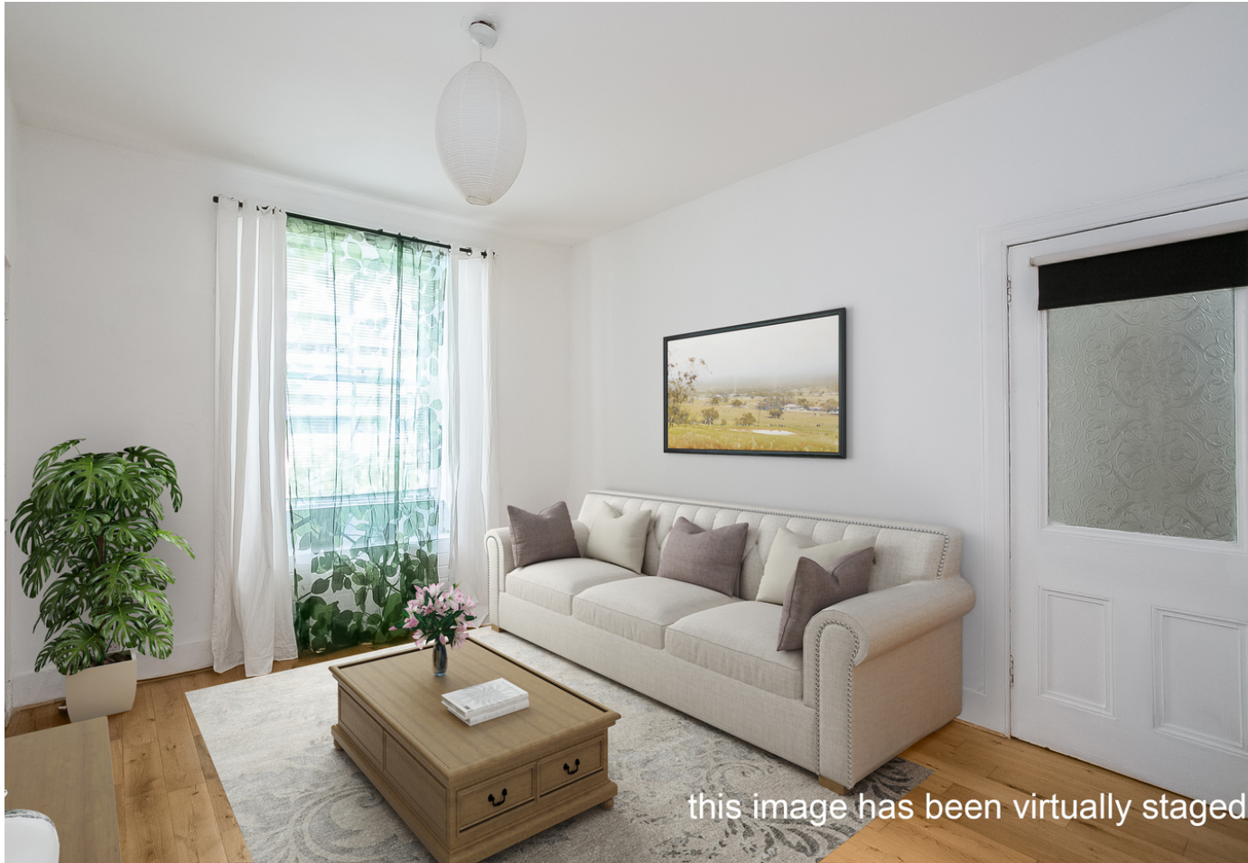
this image has been virtually staged