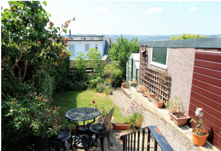
NO CHAIN £169,500