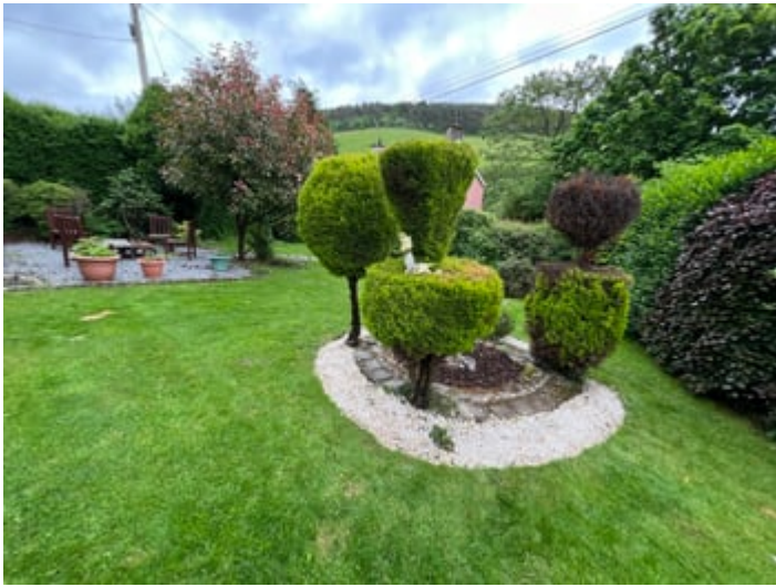
To the Side A further lawned area with 2 Greenhouses, raised flower beds, mature hedgerows.