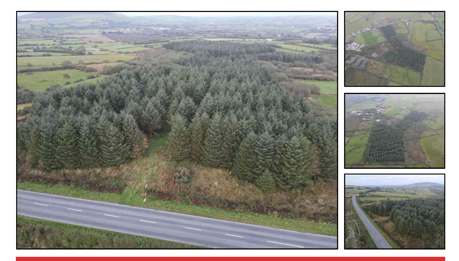
Forest Land, Adjacent to Nant Farm, Crymych, Pembrokeshire. SA41 3QS.