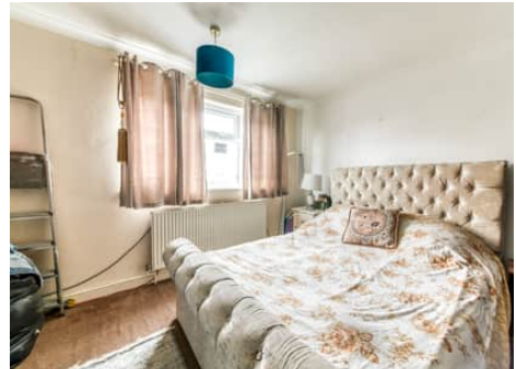
Brierley, New Addington, Croydon, Surrey, CR0 9DR