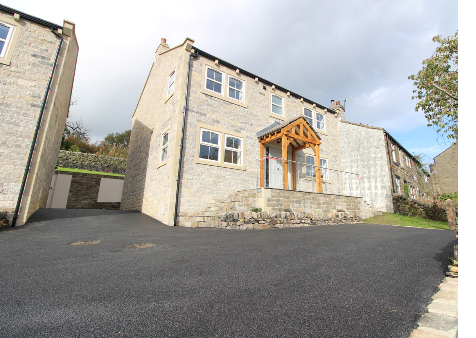
184 The Orchard, Sykes Head, Oakworth, Keighley, West Yorkshire, BD22 7ES