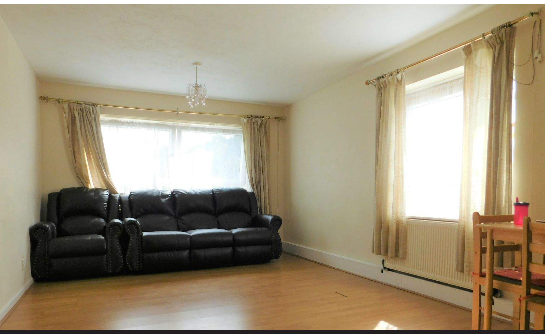
Flat 289, Dunlin House Gurnell Grove, West Ealing, £249,000 London. W13 0AG.