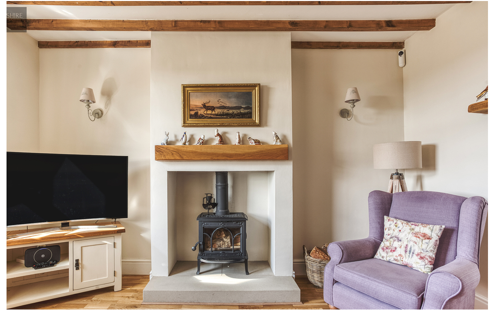
Wisteria Cottage, Booth Gate, Belper, Derbyshire DE56 2BP £315,000 - Freehold