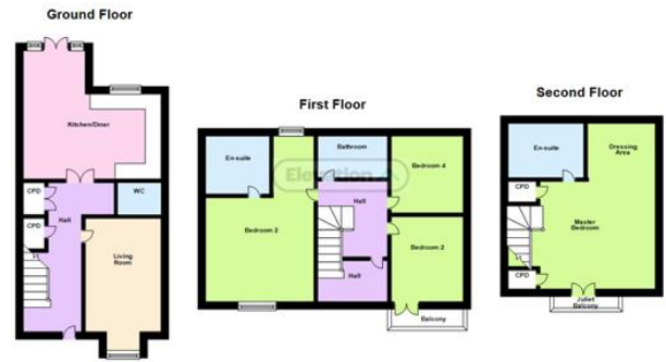
Floor plans are for layout purposes only. Measurements are approximate and subject to inaccuracies. Plans produced using ParkL.

This stunning property is located east side of Milton Keynes is within close proximity to the M1, central Milton Keynes and MK railway station. There are nearby local amenities including Waitrose, Costa Coffee and Oakgrove School Catchment. Ouzel Valley Park is also close by, offering beautiful picturesque walks.