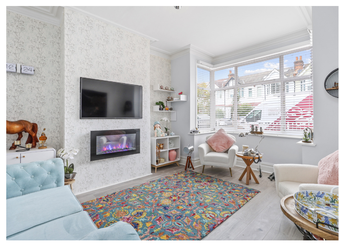
4 BEDROOM HOUSE