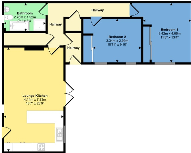
Ground Floor Approx 78 sq m / 844 sq ft

Approx Gross Internal Area 102 sq m / 1101 sq ft