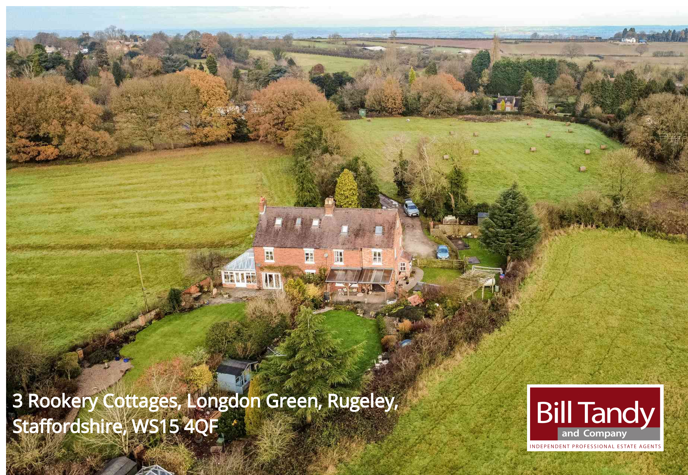
3 Rookery Cottages, Longdon Green, Rugeley, Staffordshire, WS15 4QF