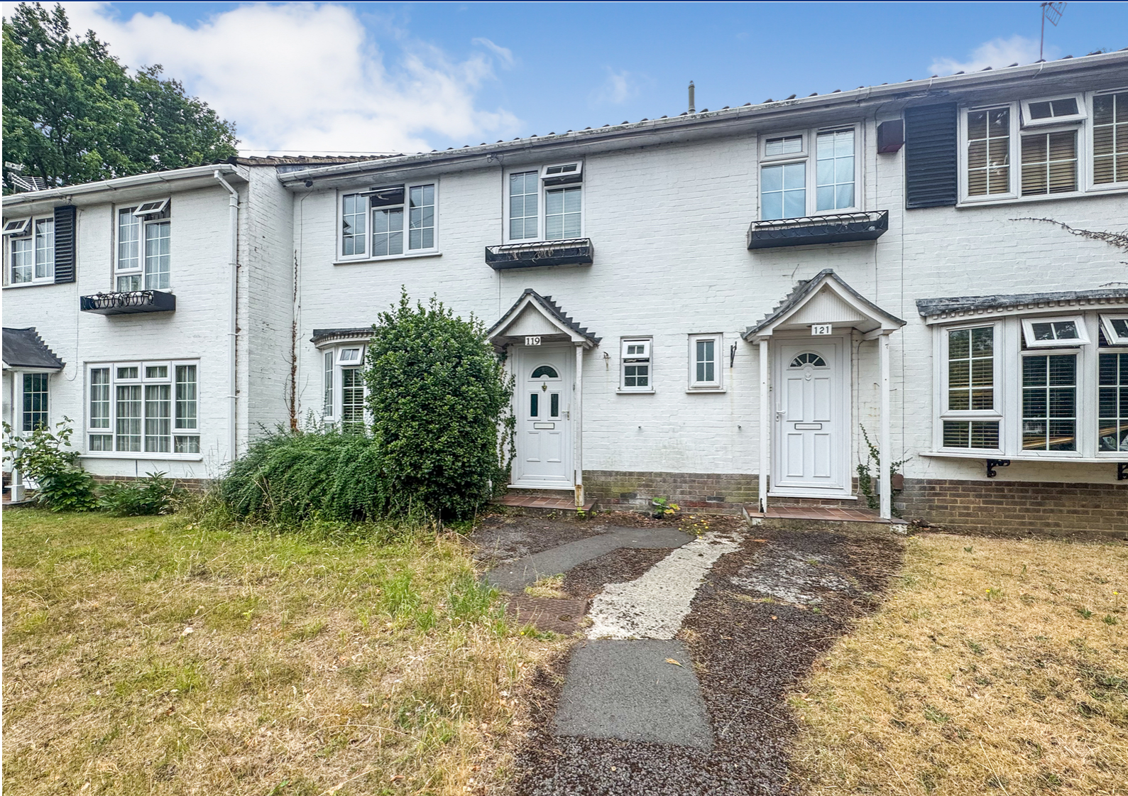
Grovelands Road, Reading, Berkshire. RG30.