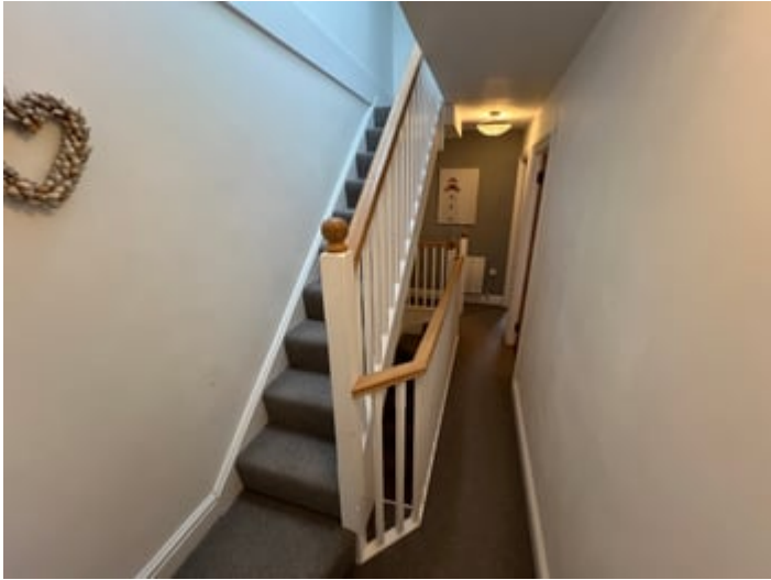
Door into airing cupboard. Stairs to second floor.