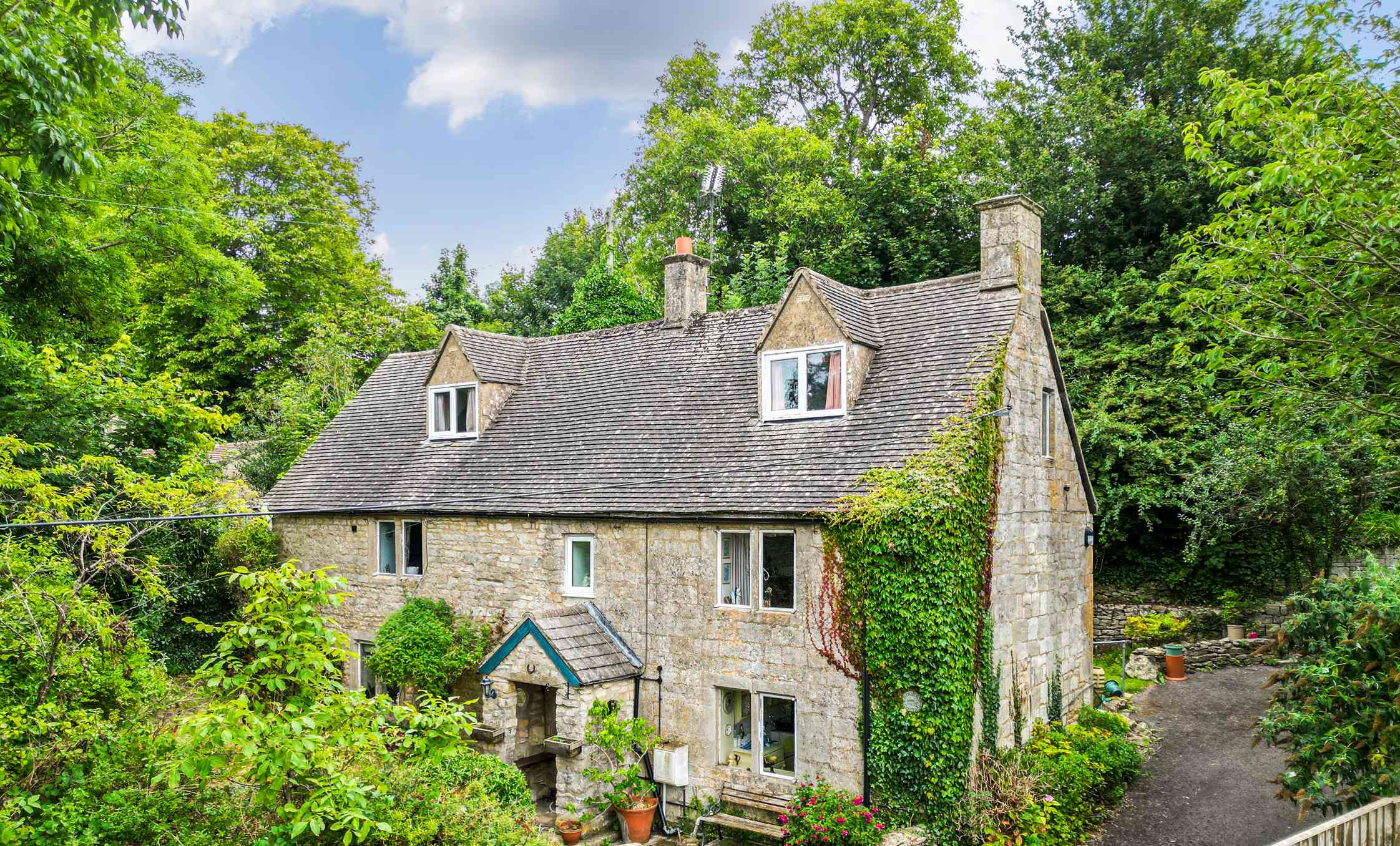
Weavers Cottage, Bussage, Stroud, Gloucestershire, GL6 8BB Guide Price £600,000