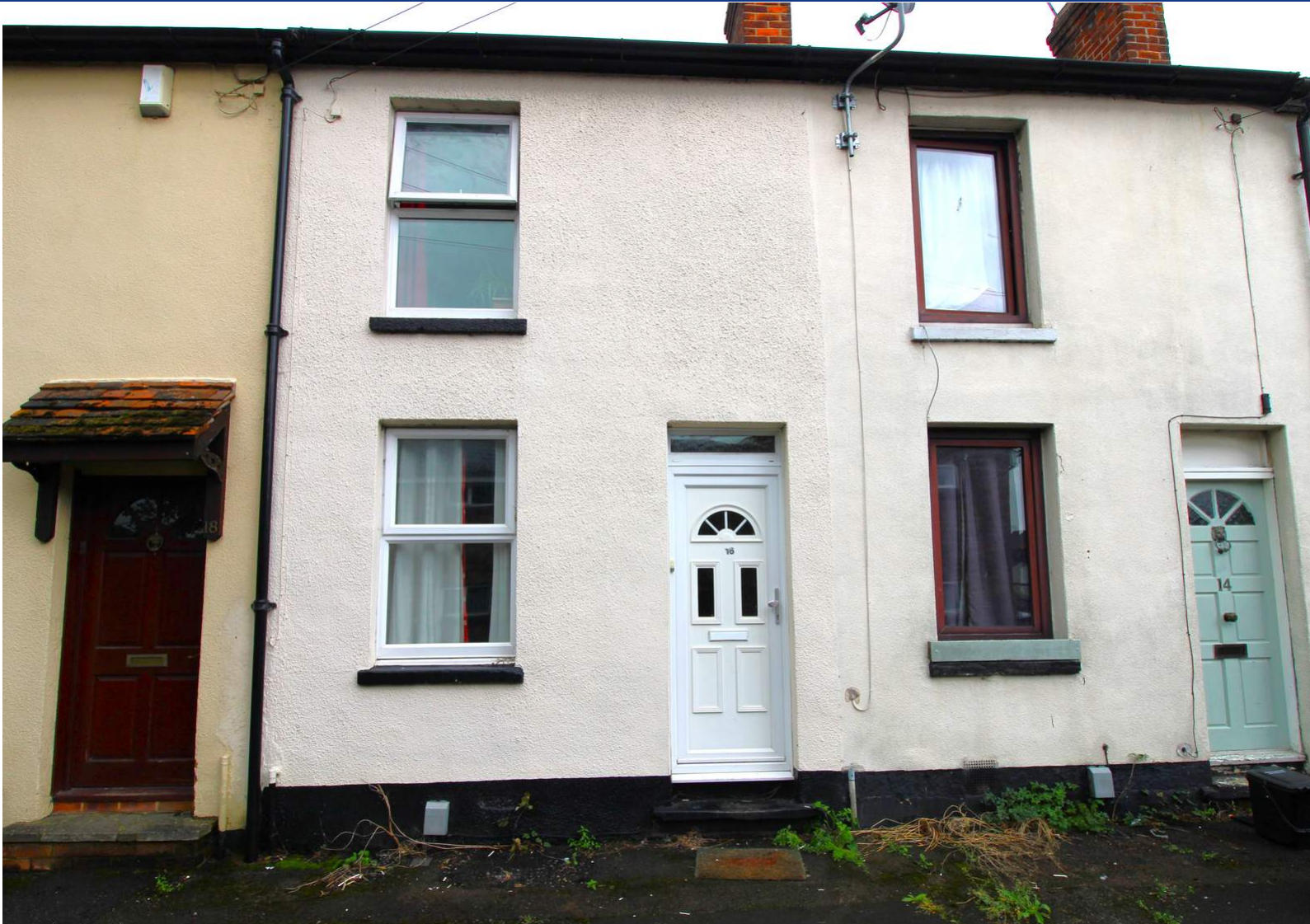
16 Highgrove Terrace, Reading, Berkshire. RG1 2TG.